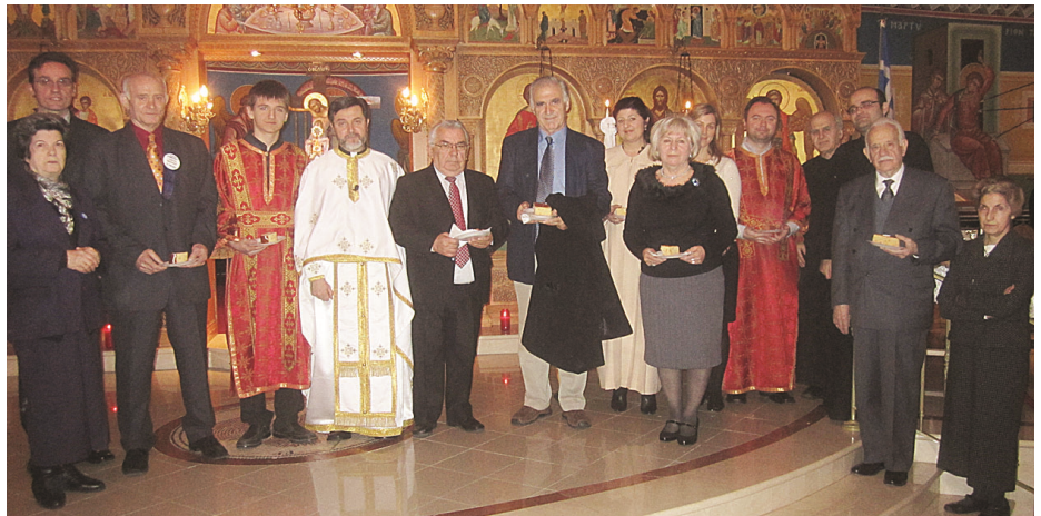
Representatives of the different ministries of St. Demetrios Greek Orthodox Church.

About St. Basil the Great: St. Basil was one of the greatest Fathers of the Christian Church and appeared on the spiritual horizon of the Orthodox Faith. He was Bishop of Caesarea, Cappadocia. He was born four years after the First Ecumenical Council held in the year 325 A.D. He is one of the three Cappadocian Fathers, along with the first person to establish an orphanage for little children and the first Christian hospital. His Feast Day is observed on January 1st. The Vasilopita is a beautiful tradition, and a custom which should not be neglected by Greek Orthodox Christians.