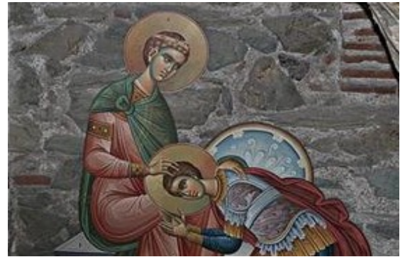
St. Demetrios blessing St. Nestor in the bath house before battle.