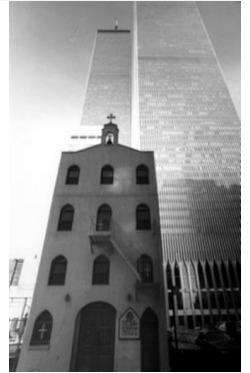
St. Nicholas Church, which was destroyed on 9/11

With this backdrop of 9/11, the Church today prepares Orthodox Christians for one of its great feasts: the Exaltation of the Holy Cross (celebrated on September 14 th ). This feast remembers not only the historical events of finding the Cross of Christ during the 4 th century by St. Helen the Equal-to-the-Apostles and the recovery of the Cross by Byzantine Emperor Heraclius from the Persians during the 7 th century (after they had stolen it). This feast also shows the importance of the Holy Cross for all Orthodox Christians –how a symbol of hatred and death can turn into a symbol of life and peace –how, when Christ died on the Cross and then resurrected from the dead, joy spread throughout the world and the devil was defeated by the Lord, opening the door to Paradise for all.